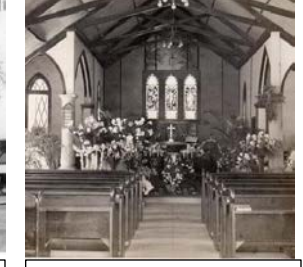
Church interior before expansion