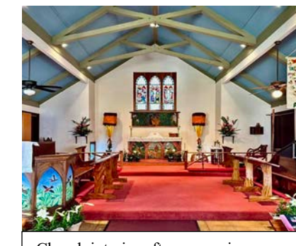
Church interior after expansion

They represent God's word winging forth from the Christian pulpit.