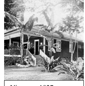
Vicarage, 1927 approx.

Moku'ula is nearby. The present Church, a parish hall and a vicarage were built in 1927. The Church was enlarged in 1959 – the side walls pushed out and large windows added resulting in the present open-air Church. A new vicarage was built in 1966 and a new parish hall was built in 1973 and in 1974 and Holy Innocents Preschool was begun. A rectory and administration/ library were completed in 1980. In 1990, the sacristy was rebuilt.