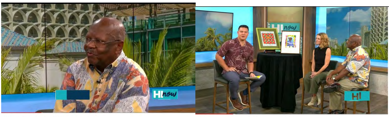
HI Now Weekender (February 4, 2023)