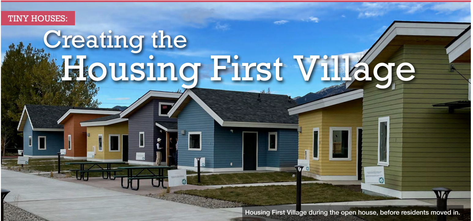
Housing First Village during the open house, before residents moved in.

BY DEACON CONNIE CAMPBELL-PEARSON November, 2022